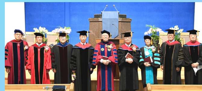
Board of Directors of GPTAM & CCGU Inauguration cum Installation Day: 13 September, 2020 Incheon, South Korea

GPTAM shall also collaborate with like-minded national and international mission organisations and agencies for worldwide mission.